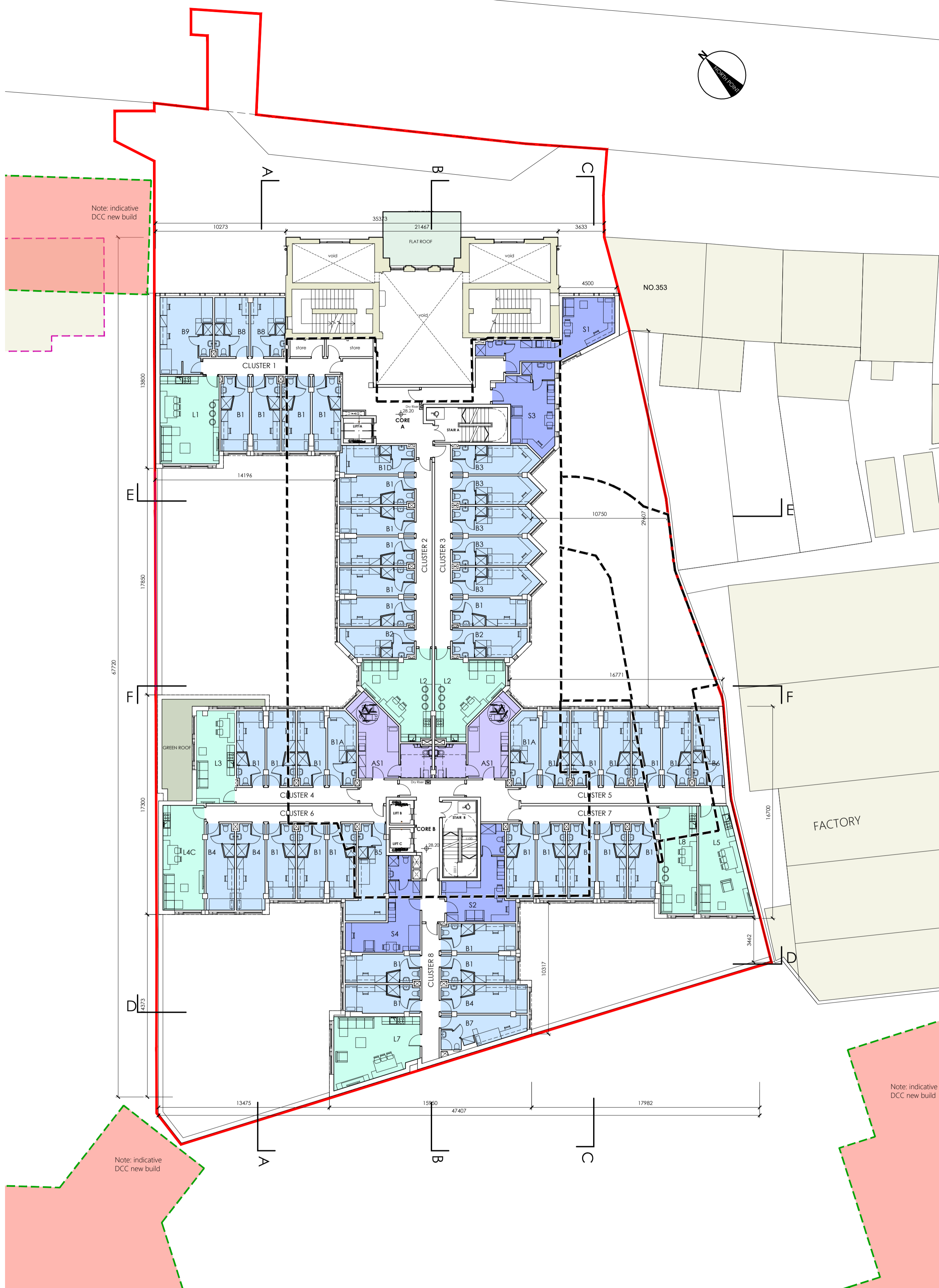
1 THIRD FLOOR PLAN (LEVEL 3) SCALE 1:200